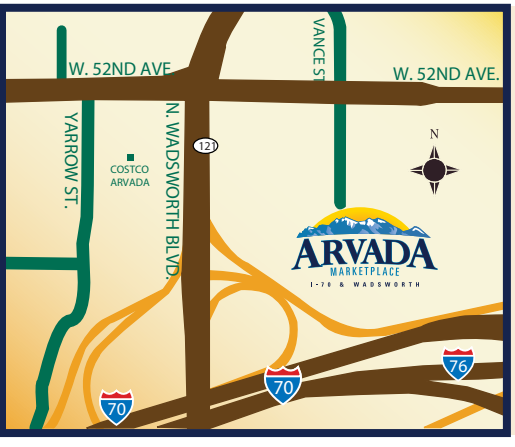
Project Size: Demographics: