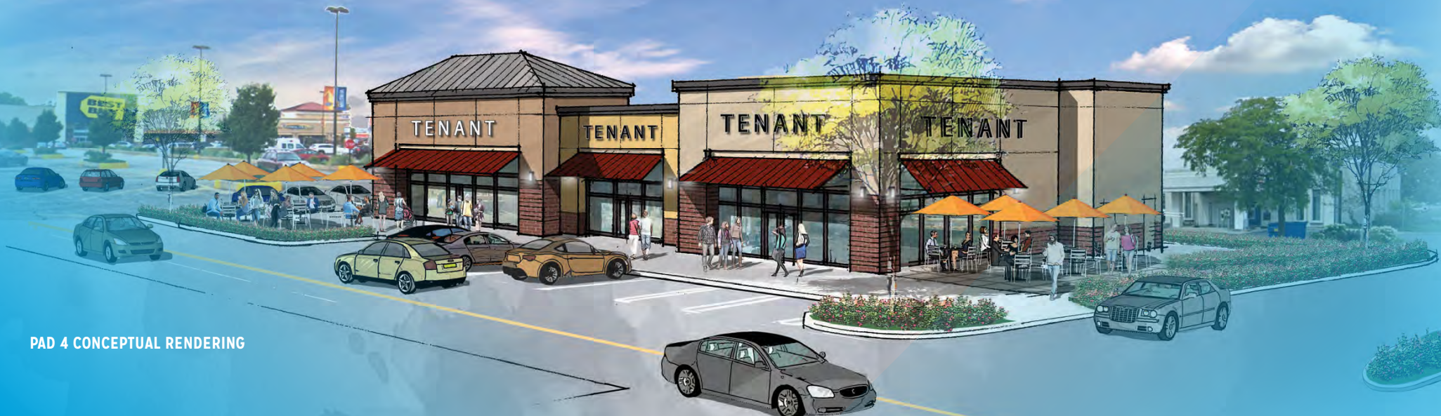
PAD 4 CONCEPTUAL RENDERING